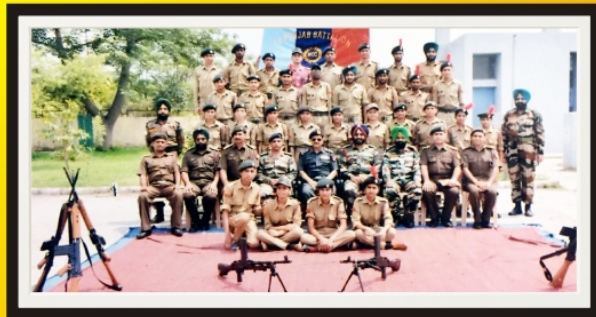
Annual Training Camp of NCC Cadets at SBBS University, Khiala.