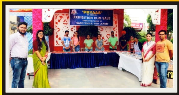
Bakery and handicrafts stall by college students under the 'Earn While you Learn' Initiative.