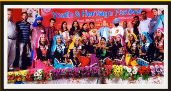
Our Sami Team receiving 1st prize in Zonal Youth Festival.