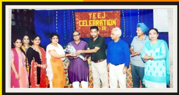
The Principal giving floral welcome to the President and office bearers on Teej Festival.