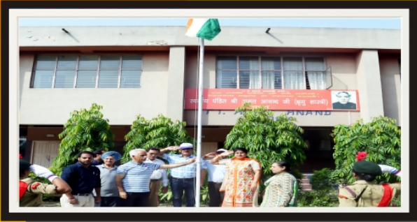
The office bearers unfurling the Tricolour on Independence Day.