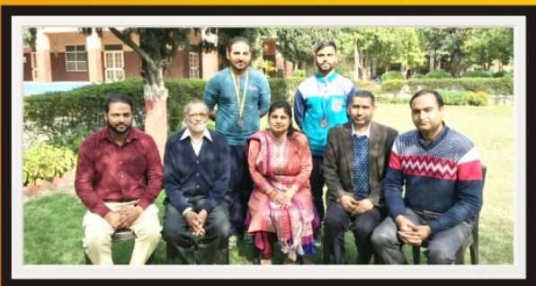
Winners of Kick-boxing with office bearers, principal and staff members.